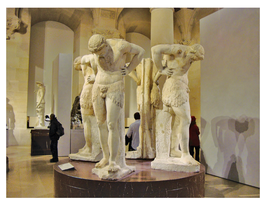
FIGURE 14.2. Satyres en atlante . Four statues depicting omphaloskepsis . 2nd Century. Roman, Marble. Louvre Museum. Wikimedia Commons.

religious rituals that were increasingly deemed pagan and outlawed. Numerous Christian monasteries were built on Mount Atos, correlating to a decline in Greek devotion to the Olympian gods and the power of Delphi and the Oracle. In 393 ce, Emperor Theodosius ordered the closing of all pagan sanctuaries including Delphi, which was taken over by Christians and finally abandoned in the seventh century (Scott, 2015; Beaton, 2021).