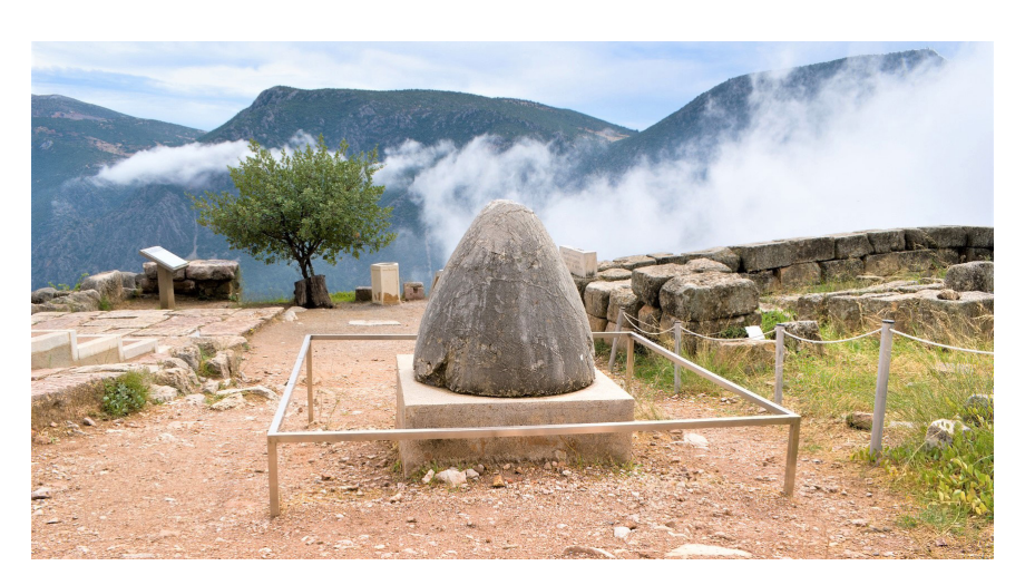
FIGURE 14.1. The navel or omphalos stone. Delphi, Greece, 2021.