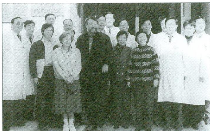
House Ear Institute (HEI) researchers visiting the PLA Institute of Otolaryngology in Beijing, China in November, 1993.

Several surveys also revealed a difference in the cause of hearing loss between developing and developed countries. In 1983, the Indian Council of Medical Research published a study of hearing loss based on a survey from 4 different parts of India. The Indian study found that for almost half of the 10.7% hearing-impaired people in rural areas, the