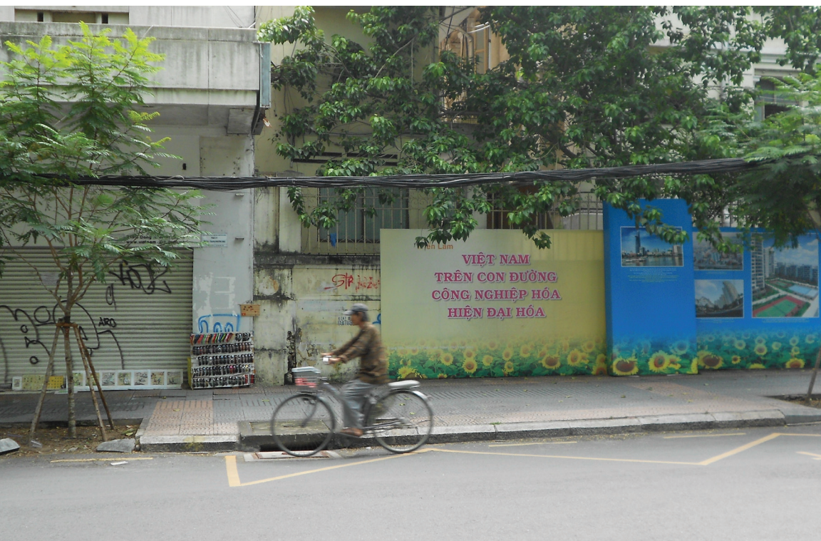
Figure 1. Street sign that translates into English as “Vietnam is on the road to industrialization and modernization”.

This is not a comprehensive study of HCMC that documents the conspicuous experience of urbanization but rather a critical piece that seeks to apprehend how this city port has been conceived historically and contemporaneously under legacies of war. Through this understudied site, I offer a transdisciplinary intervention in the fields of global studies, Asian area studies, urban studies, and history/memory studies to demonstrate how the policies and effects of war shaped and still shape the differential urbanization of cities, while puncturing the discourse of globalization and global cities by considering the “historical arrangements—and indelible traces—of genocidal state violence” (Rodriguez 2010, 3). With select examples and testimony of real-life people, I reconfigure HCMC as a fragmented cityscape riven with social inequalities, whose causes or origins can be drawn from ignoble times. Looking to the future with a rear view to the chaotic past resituates Saigon’s bumpy road toward global city status by taking into account the profound warping effects of protracted fighting upon this city.