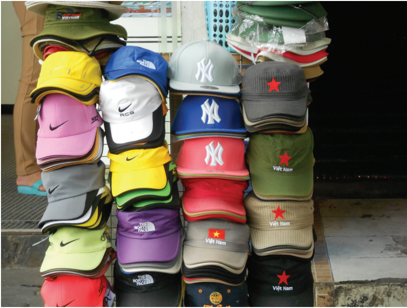
Figure 3. Hats sold by street vendor.

the caps are identical in look if dissimilar in their connotation. The brightly colored hats displaying the cosmopolitanism of global cities like New York rub up against gray and green camouflage hues of the caps exhibiting the military symbolism of Saigon. The contrast and distinction between them expose the differences in meaning ascribed to everyday objects, where “assigning value to icons and images from the war reflects historically constituted socioeconomic and geopolitical relations . . . [that] reflect the Vietnamese state’s precarious global position as it negotiates global hierarchies of power and international (especially U.S.) pressure” (Schwenkel 2009, 101).