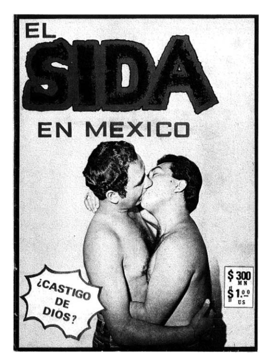
FIGURE 2. Joseph Carrier Papers, ONE National Gay and Lesbian Archive