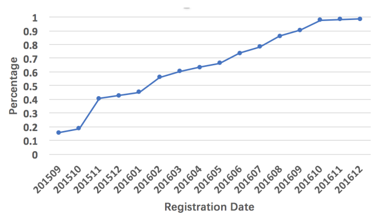
Fig. 4: ECDF of registration dates.