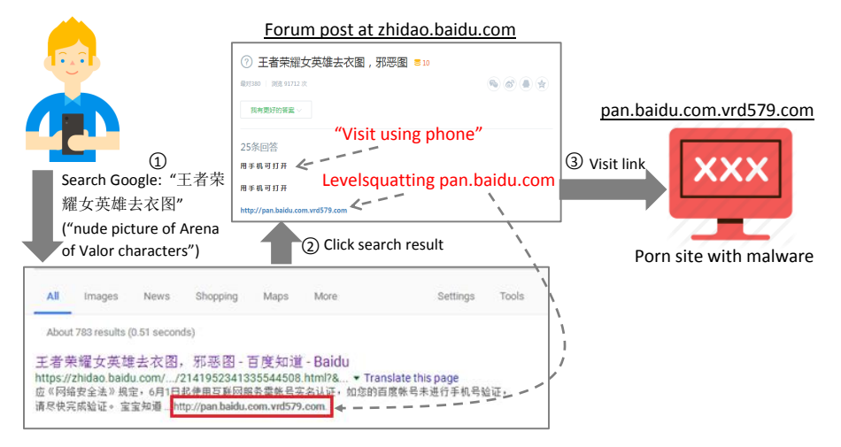
Fig. 7: An example showing how a visitor reaches a levelsquatting domain.

Here we give a real-world example showing how a visitor reaches a levelsquatting domain from the website referral, and illustrate it in Figure 7. The attacker first posts a thread on zhidao.baidu.com which advertises a link pointing to pan.baidu.com. vrd579.com, a levelsquatting domain impersonating pan.baidu.com, Baidu's cloud-drive service. The thread tops the search result when a user queries "nude picture of Arena of Valor characters" (translated from Chinese). When user follows the search result and the link in the post by mobile, she will land on the levelsquatting site while only "pan.baidu.com" will be shown in her browser address bar, which will induce her to input her password or download malicious apps.