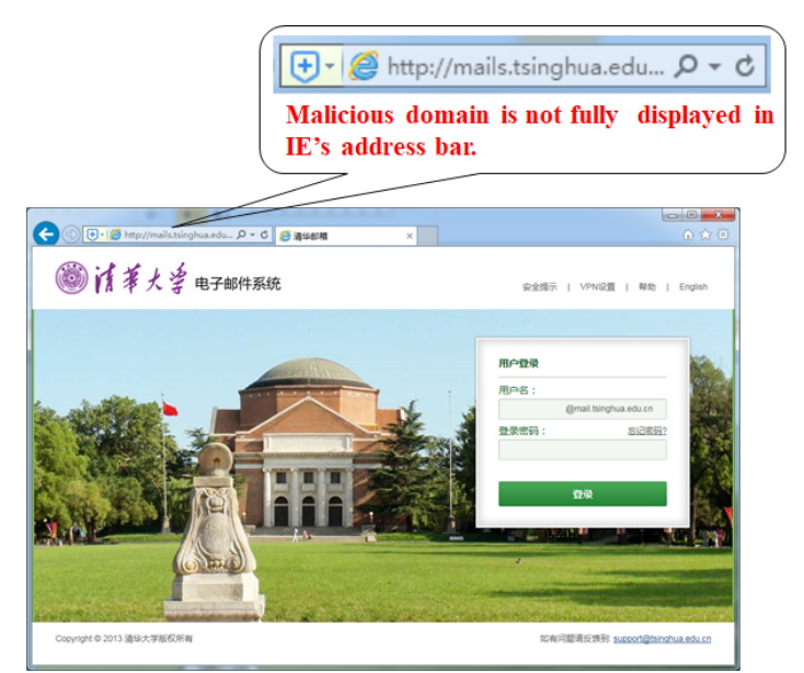
Fig. 1: An example of Levelsquatting domain displayed in IE.

As a real-world example, Figure 1 shows a phishing website with a long domain name, mails.tsinghua.edu.cn.locale.rebornplasticsurgery.com, displayed in IE browser's address bar with default settings. The domain name is so lengthy that only the subdomain mails.tsinghua.edu.cn can be displayed, which is identical to the authentic login domain name of Tsinghua university. A user can be deceived to put her login credential when visiting this website.