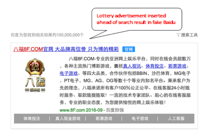
Fig. 8: Fake Baidu search result.

in this case. Browser vendors should carefully design the address bar to either leave enough space for domain name or notify users when part of the domain, especially the e2LD section, is hidden. Unfortunately, not all browsers follow these design principles.